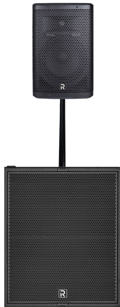
WITH River Acoustics Fortis HP 18S SUBWOOFER