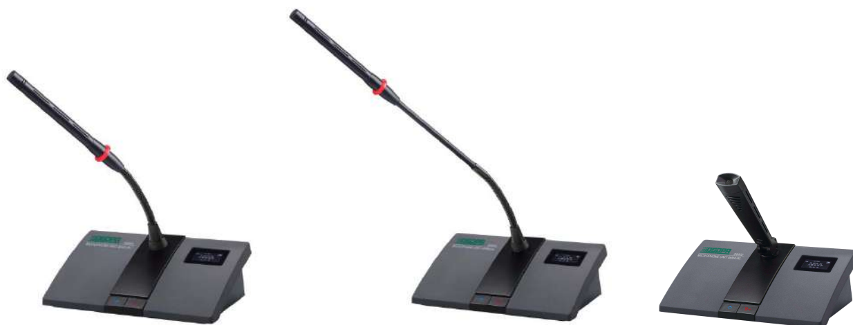
D6802/D6802L Chairman MIC